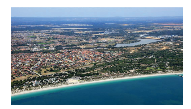
Above: The Cockburn coastline presents several recreation and tourism related opportunities for the Economic Development Strategy to identify and plan for.