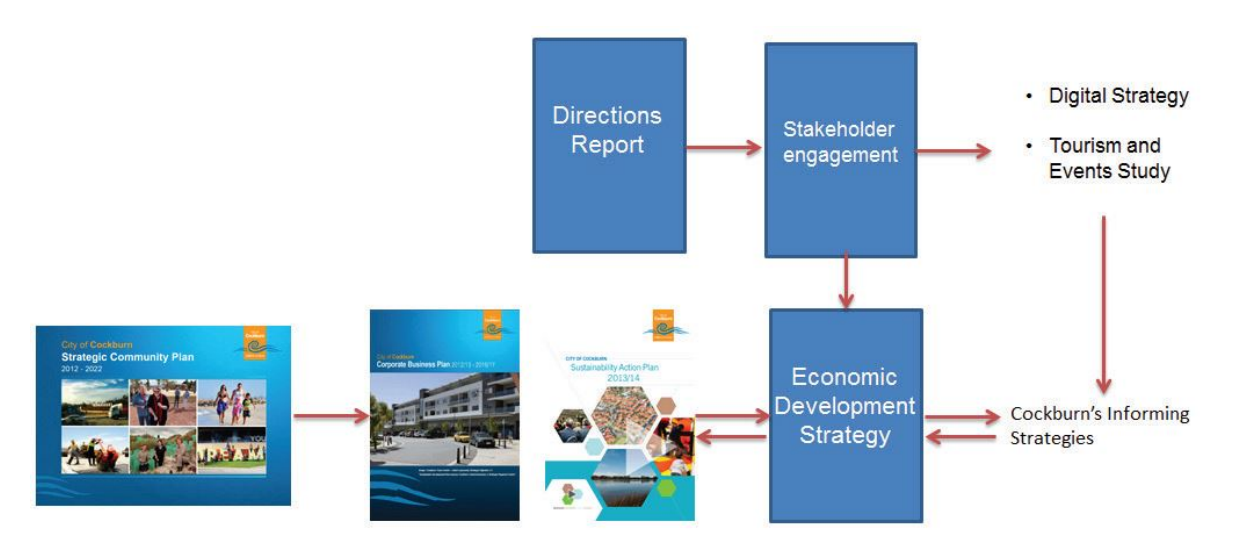
Figure 1: Draft Integrated Planning Framework - proposed hierarchy incorporating economic development.

This slow in growth is likely to see a change in focus for the City, moving away