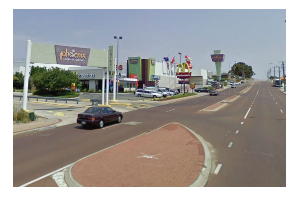
Above: Phoenix shopping centre, centrally located within Cockburn and recognised as an important District centre in the Activity Centre Framework.

Activity centres contribute to the provision of jobs in Cockburn and provide shopping, commercial and community services. They are meeting places for the community and can commonly impact on the identity of surrounding communities, in addition to first impressions of an area for visitors to the region. As a result, a key focus of economic development in Cockburn should include planning to ensure the continued maturing of Cockburn's activity centres.