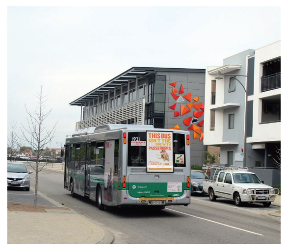
Above: The emerging Cockburn Central Regional Centre provides a mix of residential and commercial uses with good links to a range of transport options.

from its major land and infrastructure delivery role, to having to provide a greater focus on supporting Cockburn's key strategic industries and local businesses of which have arisen as a result of these developments. This will include identifying an approach to support the regions key strategic sectors and to enable more Cockburn residents to work closer to home rather than commuting to distant employment centres.