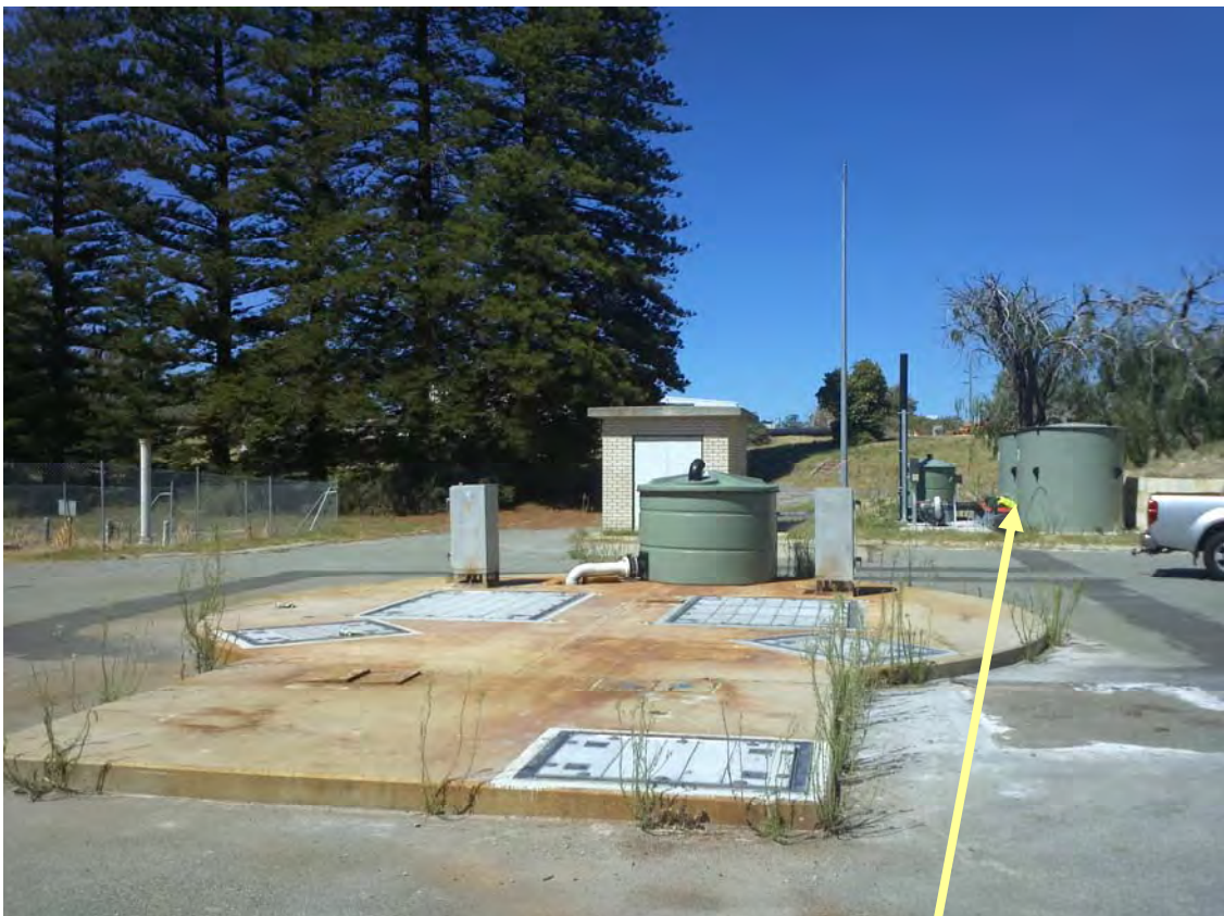
Wet Well with Odatech Treatment in background