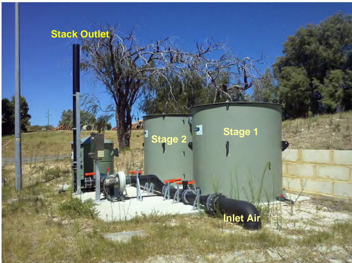
Odatech Treatment Plant