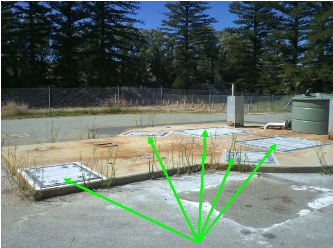
Wet Well (fully sealed)