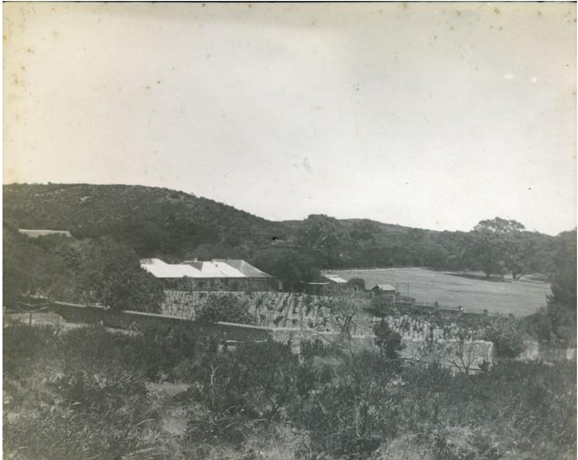
Plate 1 View of the vineyard and the eastern side of Davilak Homestead c.1900