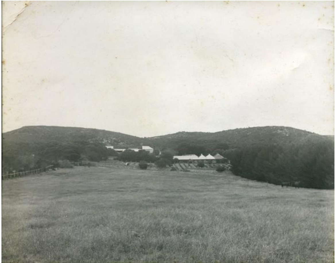
Plate 2 View looking west across paddocks towards Davilak. The long line of the homestead can be seen on the right and beyond, to the left are the farm buildings. The line of vines can be clearly seen in front of the homestead.

As indicated at the beginning of this report, the physical evidence of this high stone wall was hard to find. Small sections of the eastern wall were observed in the cleared area directly to the east of the fenced off ruins. By assessing the documentary evidence it is now possible to understand why there is little evidence surviving above ground of the northern wall of the enclosure. The timber palings would have been destroyed in the 1960 fire, leaving the columns as an isolated line. As these pillars were close to the road, the limestone was probably taken to be recycled elsewhere. The lack of evidence for the western and eastern walls is unclear, although again it could be due to robbing of material. Manning noted in his plan that the southern wall had started to collapse sometime during World War 2 due to nearby artillery practice. Archaeological investigations could provide information on the line of the northern wall and the removal of vegetation along the line of the east, west and southern walls would assist in determining the extent of what remains of these walls.