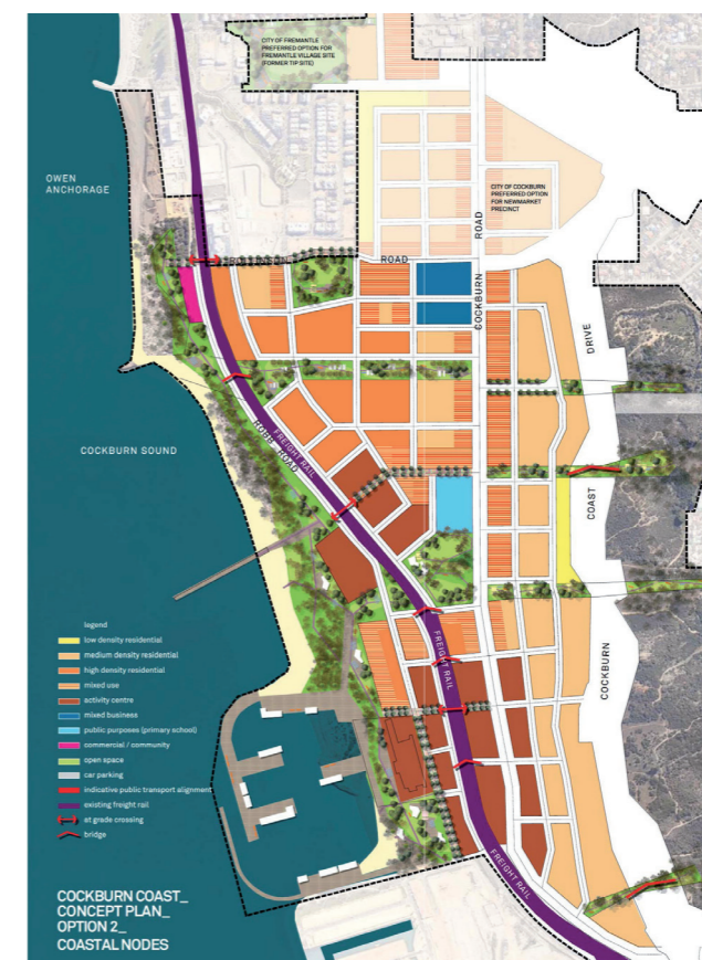
Figure 4 Option 2_Coastal Node Alignment