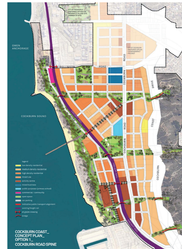
Figure 3 Option 1_Cockburn Road Alignment

A series of sustainability targets were established within the DSP and have been integrated through the district structure planning process via a comprehensive sustainability framework. Further details of the sustainability framework and green infrastructure process and outcomes can be found at Chapter 6.0.