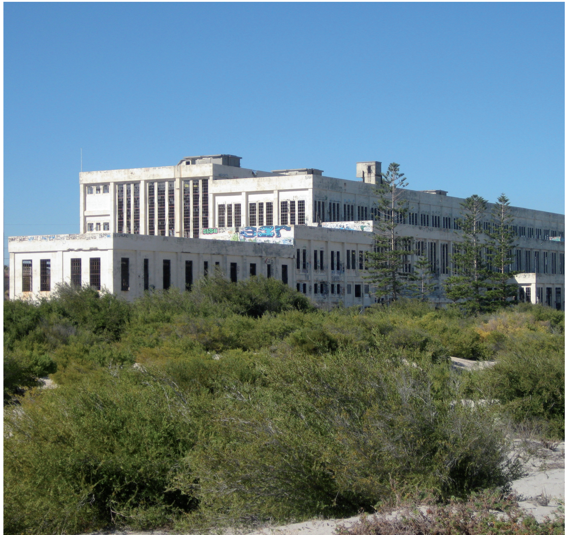
One of the key challenges is the reuse of South Fremantle Power Station

Section 11 concentrates on considerations relative to implementation of the plan, including staging, cost sharing, modifications to the statutory framework and governance framework.