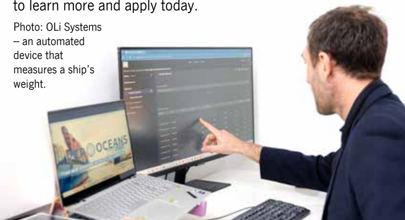
Photo: OLi Systems – an automated device that measures a ship's weight.

Visit www.cockburn.wa.gov.au/BusinessGrants to learn more and apply today.